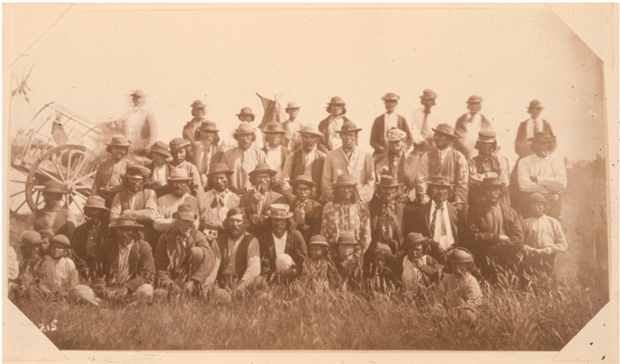
Métis buffalo hunters photographed on the Milk River Plains by the British North American Boundary Commission, July 18th, 1874.

All rights reserved. No part of this essay may be reproduced or transmitted in any form, by any means, without written permission from the author, except by a reviewer, who may quote brief passages in review.